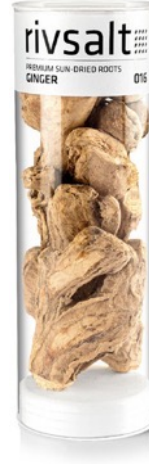
016 GINGER Premium sun dried roots from India.