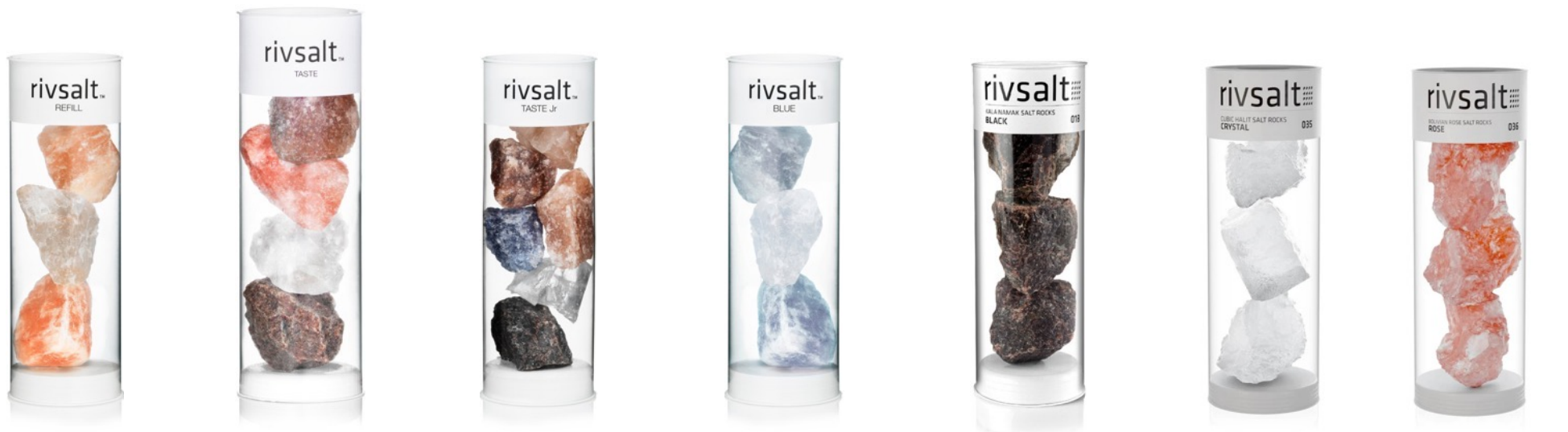
002 THE ORIGINAL Himalayan salt rocks from northern Pakistan.

Taste all the flavors and decide which ones are your favorites and use them with our large KITCHEN [005] product or on the dining table with our original RIVSALT [001] product.