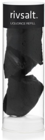
004 LIQUORICE REFILL Delicious 100% raw liquorice rocks.

Start your day with a cup of tea topped of with our TURMERIC & GINGER, make your dinner an experience with our PEPPER and don't forget to make your favorite dessert even better with our CINNAMON and LIQUORICE.