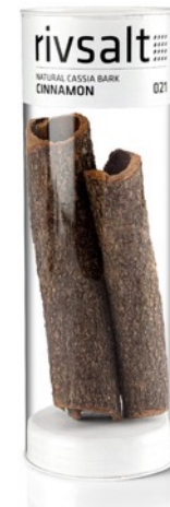
021 CINNAMON Cinnamon in the form of cassia bark.