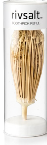
014 TOOTHPICK REFILL Extravagant Moroccan toothpick flower.